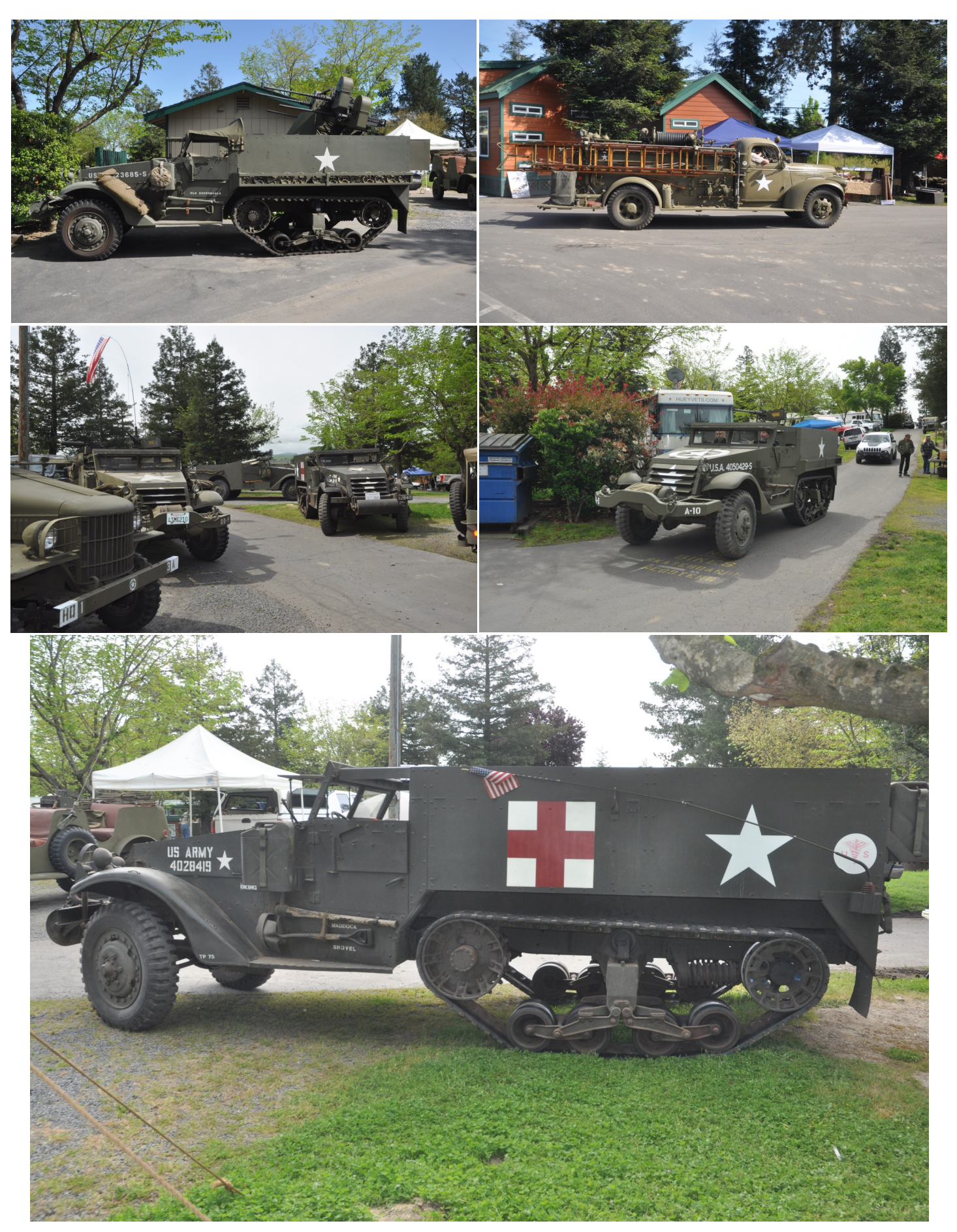
Page 8 and 9 Pictures from 2018 Camp Petaluma